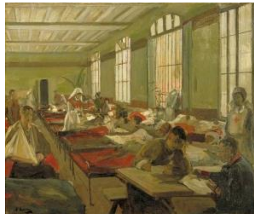
'German Wounded, Le Havre' Sir John Lavery (1919)

The work of both artists reflects the political and social impact of the war in ways which still resonate almost a century later.