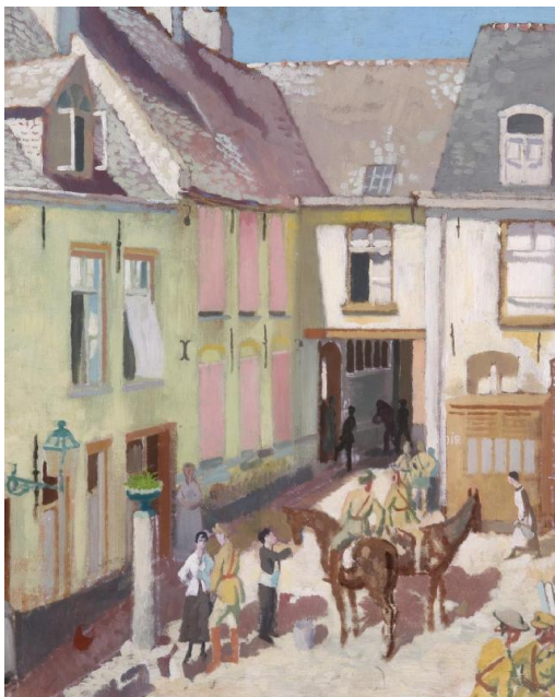
'The Courtyard, Hôtel Sauvage, Cassel, Nord' Sir William Orpen (1917)

Two Irish Artists and the First World War