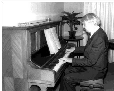
Anthony Burgess playing the piano in the Princess Grace Irish Library

ANTHONY BURGESS (1917-1993), a Founding Trustee of the Princess Grace Irish Library, moved to Monaco in 1975. Living in the top-floor apartment at 44 rue Grimaldi, he wrote many of his most famous works in the Principality, including Earthly Powers (1980), A Dead Man in Deptford (1993) and the two volumes of his autobiography, Little Wilson and Big God (1987) and You've Had Your Time (1990). His detailed diary of his life on the Riviera has been preserved in the archive of the International Anthony Burgess Foundation.