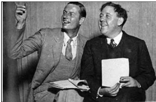
Guthrie with Charles Laughton at the Old Vic (1933-4) where Laughton played Macbeth, Lopakin in the The Cherry Orchard, etc.

Entry 10 Euro per person payable at the door. Reservation essential due to limited number of seats. The street doors will be closed at 20:00 sharp.