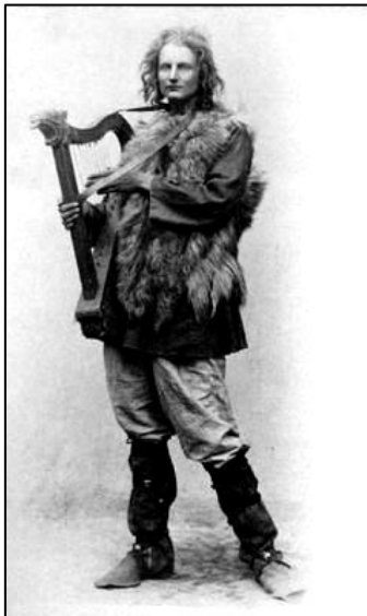
Guthrie as a student actor at Oxford, 1918.

His most recent book is Buffoonery and Easy Sentiment (Carysfort Press 2011), a study of the popular Irish theatre that was despised by W. B. Yeats and Lady Gregory.