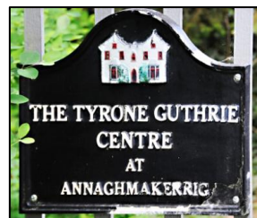
Present-day name-plate at Annaghmakerrig.