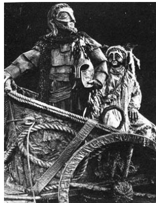
Guthrie's production of Sophocles' King Oedipus in the Yeats version at Stratford, Ontario, 1955